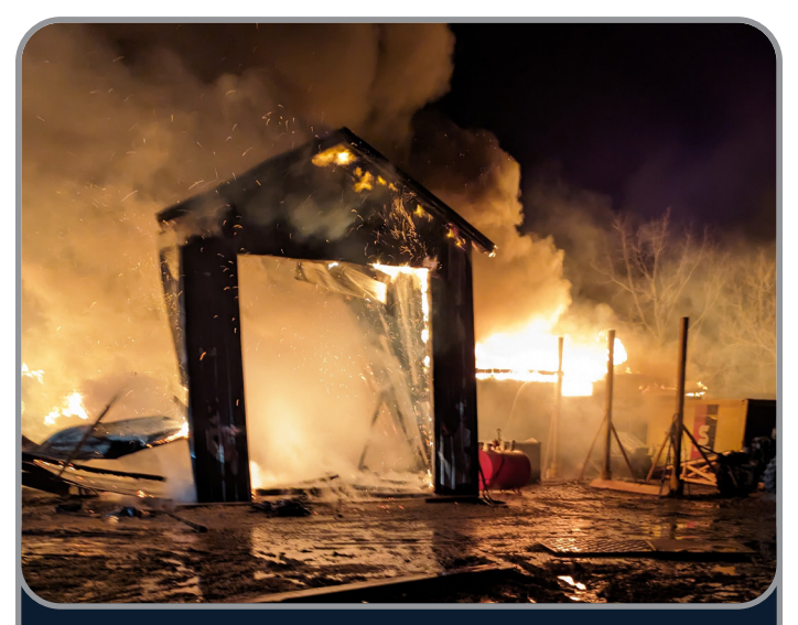
On 1/16/24 @ 20:27 hours crews responded mutual aid into Wayne Township for a reported building fire. Upon arrival, crews found a singlestory barn fully involved in fire. Crews deployed a defensive strategy and assisted in extinguishing the fire until released by command.

On 1/16/24 (a) 09:00 hours, crews responded to a nursing home for a reported cardiac arrest. Upon arrival, crews determined the patient was DOA. Crews contacted the coroner and released the scene to Springboro PD.